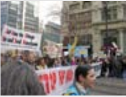
a hunger strike a sit-down protest a protest march